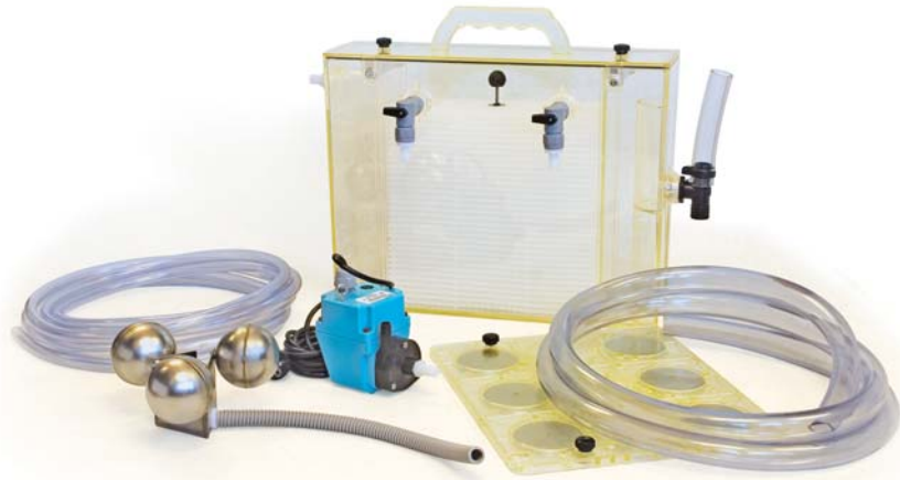
C-Thru Separat Transparent Tramp oil separation unit