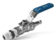
BALL VALVE HOSE ADAPTER