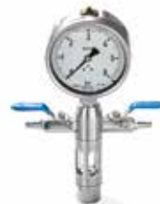
VENT TC VALVE + CLAMP