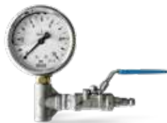
VENT BSPM BALL VALVE