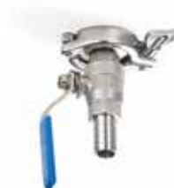
BALL VALVE TC + CLAMP